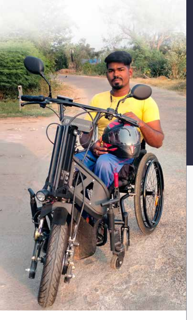
Incubated at IIT Madras